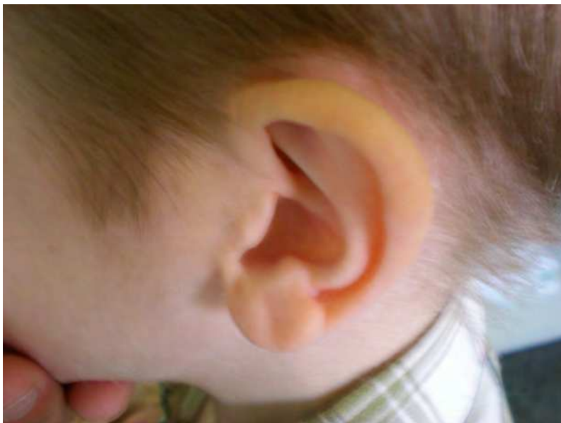
Fig. 3. Clinical facial features in MWS. The ear lobes are very typical. They are large and uplifted with a central depression and have been described as being like "orecchiette pasta" or like "red blood corpuscles" in shape. They do not change significantly with time (with the exception of the central depression, which is less obvious in adults) and are an excellent diagnostic clue

However, the distinct facial features of MWS, in addition to the other typical congenital anomalies, should allow distinguishing these two conditions. Differential diagnosis is also necessary for MWS patients presenting with hypospadias and mental retardation to avoid misdiagnosis as Smith-Lemli-Opitz syndrome, Opitz G/BBB syndrome or X-linked mental retardation-alpha thalassemia syndrome. Again, facial phenotype should be the clue for correct diagnosis.